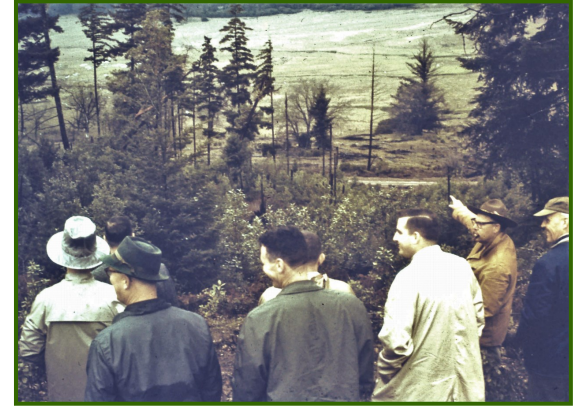
Oakland Council's first visit to Foley Ranch (looking out towards Waterfront from what is now O'Riley's Outpost)

During that same week back in 1966, our sister camp, Camp Royaneh had over 460 scouts and former camp, Camp Dimond-O had over 300 scouts. With the estab-